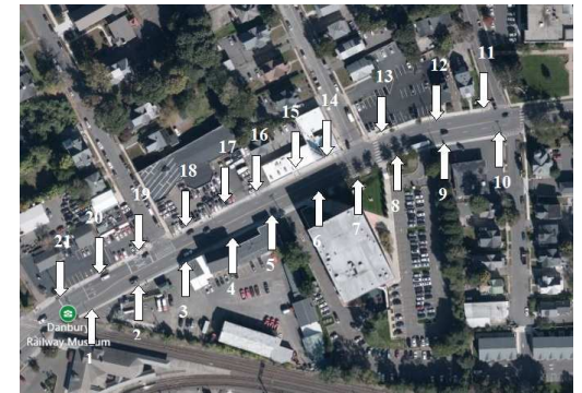
Map showing the approximate banner locations on White Street.

Danbury Veterans Affairs Office in the Patrick R. Waldron Veterans Hall on Memorial Drive. Applications require the filled out form, a photograph copy of the hero preferably in military uniform, proof of honorable discharge, photo release acknowledgement and a check for $140, which will cover the printing and installation costs. Even if you were not honoring a veteran, donations to support this effort would be welcomed to help offset costs.