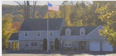
Danbury Veterans Affairs Office

This office is a conduit for veterans to seek assistance with the preparation and filing of appeals of decisions denying benefits.