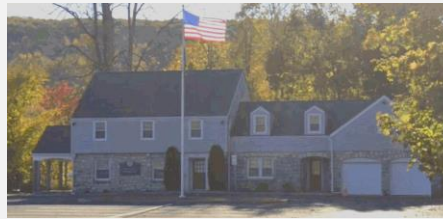
Danbury Veterans Affairs Office