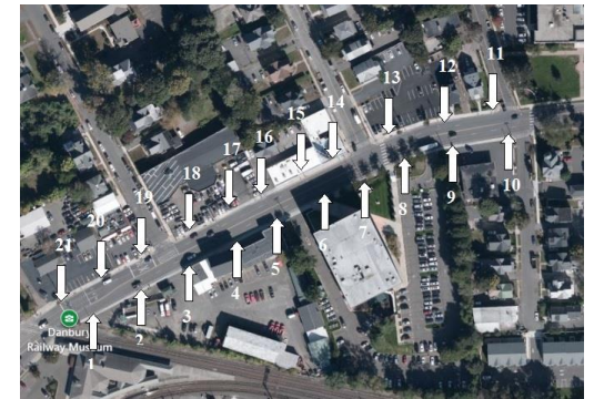
Map showing the approximate banner locations on White Street.

The application can be downloaded from our website or by stopping in at the Danbury Veterans Affairs Office in the Patrick R. Waldron Veterans Hall on Memorial Drive. Applications require the filled out form, a photograph copy of the hero in uniform, proof of honorable discharge, photo release acknowledgement and a check for $120, which will cover the printing and installation costs. Even if you were not honoring a veteran, donations to support this effort would be welcomed to help offset costs.