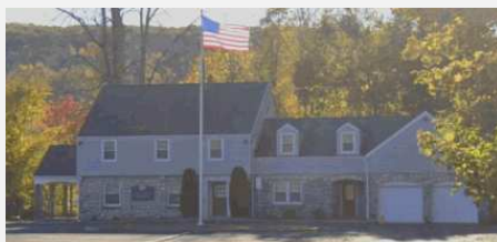
Danbury Veterans Affairs Office

This office is a conduit for veterans to seek assistance with the preparation and filing of appeals of decisions denying benefits.