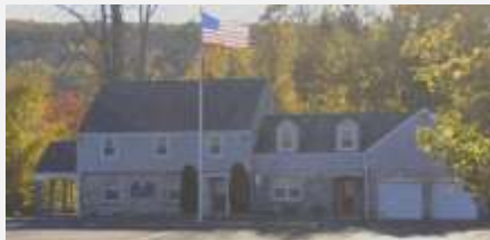
Danbury Veterans Affairs Office

This office is a conduit for veterans to seek assistance with the preparation and filing of appeals of decisions denying benefits.