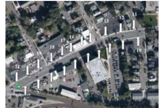
Map showing the approximate banner locations on White Street.

The application can be downloaded from our website or by stopping in at the Danbury Veterans Affairs Office in the Patrick R. Waldron Veterans Hall on Memorial Drive. Applications require the filled out form, a photograph copy of the hero in uniform, proof of honorable discharge, photo release acknowledgement and a check for $160, which will cover the printing and installation costs. Even if you were not honoring a veteran, donations to support this effort would be welcomed to help offset costs.